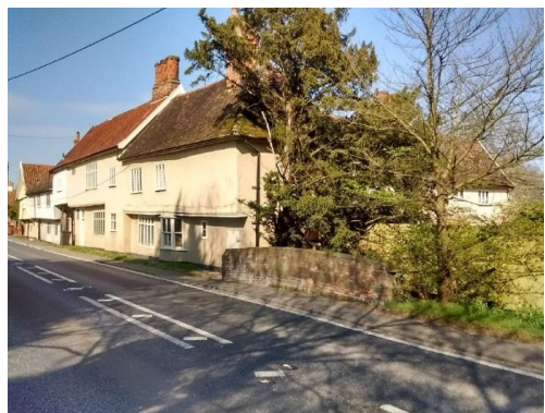
Bridge over the River Dove at Brockford

And should you walk down the 'ancient lane' (the footpath leading from Griffin Lane), you will certainly see evidence of the 'gravelly way' they refer to.